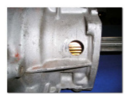
Verify that the teeth of the reluctor can be seen thruogh the new hole