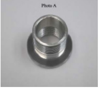
Due to the different variations in 4L60E transmission case thicknesses you maybe be required to modify part number 716073B (see photo A shaded area) or your transmission case to obtain .010" - .012" gap (see photo B).