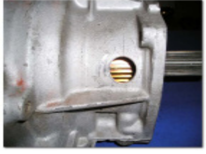
4. Verify that the teeth of the reluctor can be seen thruogh the new hole