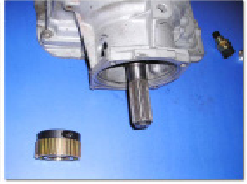
The clamp on reluctor gets installed onto the 4L60E output shaft and locked into position. If a 700R shaft is to be used, a different set collar in needed.