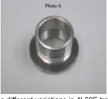
Due to the different variations in 4L60E transmission case thicknesses you maybe be required to modify part number 716073B (see photo A shaded area) or your transmission case to obtain .010" - .012" gap (see photo B).