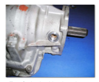
Test fit the bushing into the transmission housing. Make sure the bushing fits snug to the outside of the transmission. Note: You will have a small gap on the top and bottom side of this bushing, between it and the transmission.