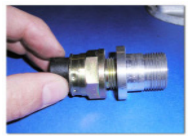
Remove the bushing after test fitting and then install the new reluctor sensor.