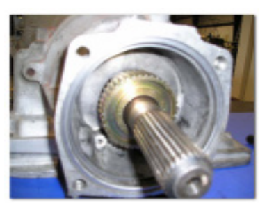
3. Reluctor ring installed