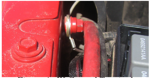
Figure 4: JK Ground Terminal

The components packaged in this kit have been assembled and machined for specific type of conversions. Modifications to any of the SPECIAL NOTE: components will void any possible warranty or return privileges. If you do not fully understand modifications or changes that will be required to complete your conversion, we strongly recommend that you contact our sales department for more information. This instruction sheet is only to be used for the assembly of Advance Adapter components. We recommend that a service manual pertaining to your vehicle be obtained for specific torque values, wiring diagrams and other related equipment. These manuals are normally available at automotive dealerships and parts stores.