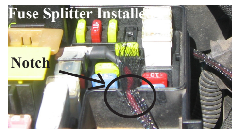
Figure 3: JK Power Connection