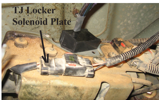
Figure 2: TJ Mounting Location