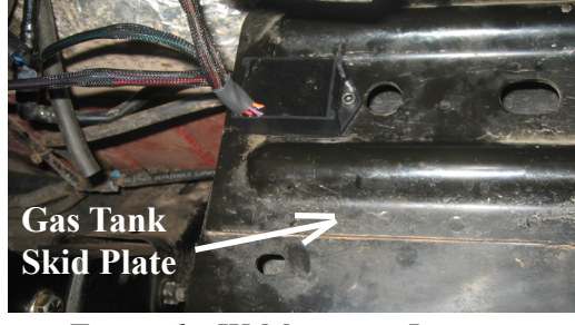
Figure 1: JK Mounting Location