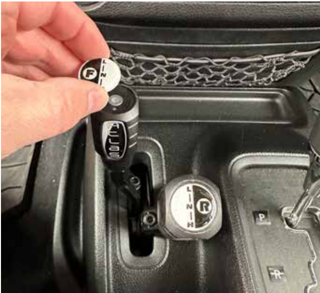
Install the shifter knobs and apply the shift stickers.