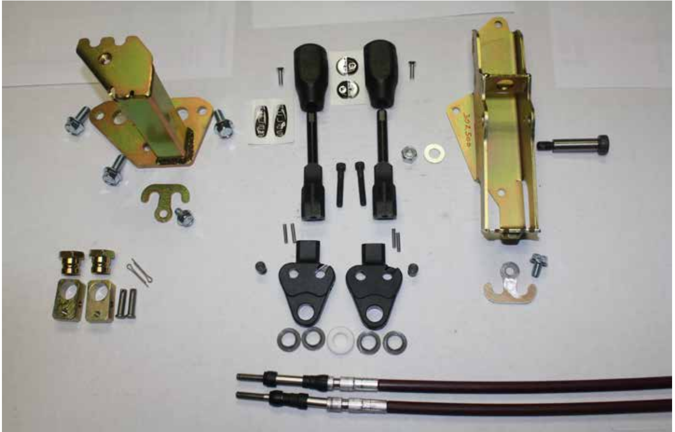
Photo of all the parts in a close proximity to how they are installed

SPECIAL NOTE: The components packaged in this kit have been assembled and machined for specific type of conversions. Modifications to any of the components will void any possible warranty or return privileges. If you do not fully understand modifications or changes that will be required to complete your conversion, we strongly recommend that you contact our sales department for more information. This instruction sheet is only to be used for the assembly of Advance Adapter components. We recommend that a service manual pertaining to your vehicle be obtained for specific torque values, wiring diagrams and other related equipment. These manuals are normally available at automotive dealerships and parts stores.