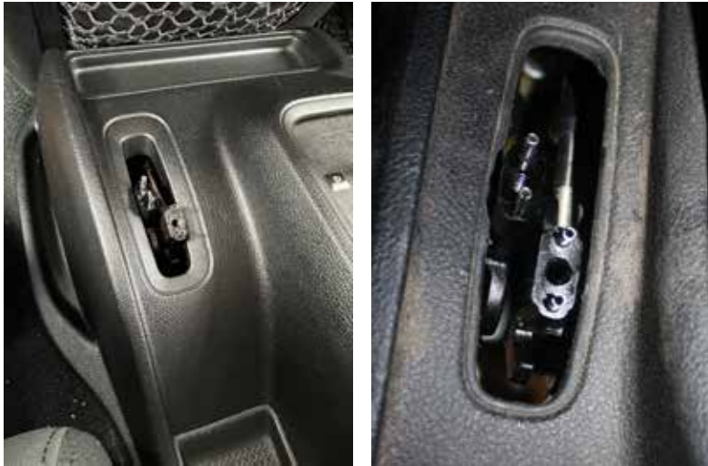
Automatic and Manual transmission installs

With the handle base cables connected and the shifter housing installed, you can put the console back in place. You should see the two bases with the dowel pins sticking through the console slightly.