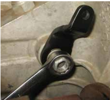
Figure 29: New Transfer Case Shift Lever Orientation

Note: shift knob shown is labeled for a NP241. The NP231 should be 4L N 4H 2H