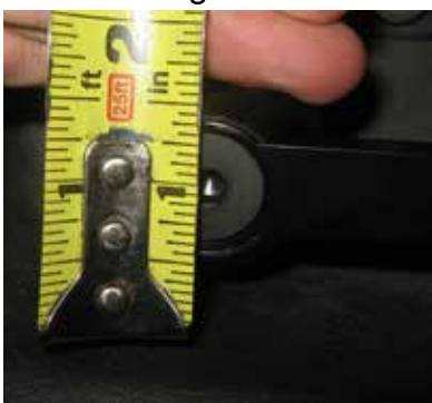
Figure 21: 1" from console