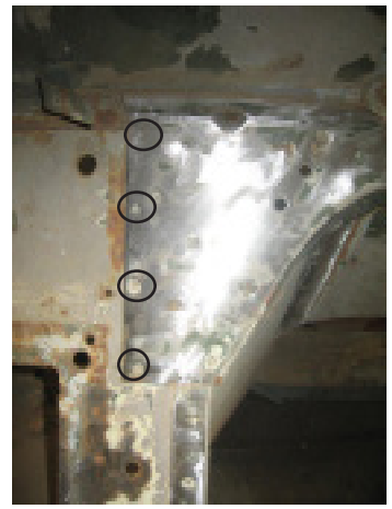
Bulkhead spot welds

To provide room for a "V" type engine and maintain the original look of the vehicle It is necessary to widen the firewall or "bulkhead" to accept the wider engine. This is easily done by drilling out the spot welds that hold the center panel to the foot well. Remove the panels individually and save them for reuse. Drill out the spot-welds of the inner kick panel. The goal is to match to foot well dimensions to the driver side (LHD). Essentially creating a large factory appearing opening. Fabricate a new center panel keeping in mind the bell housing size, depending upon engine, transmission and placement .