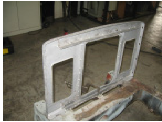
Completed modified radiator support