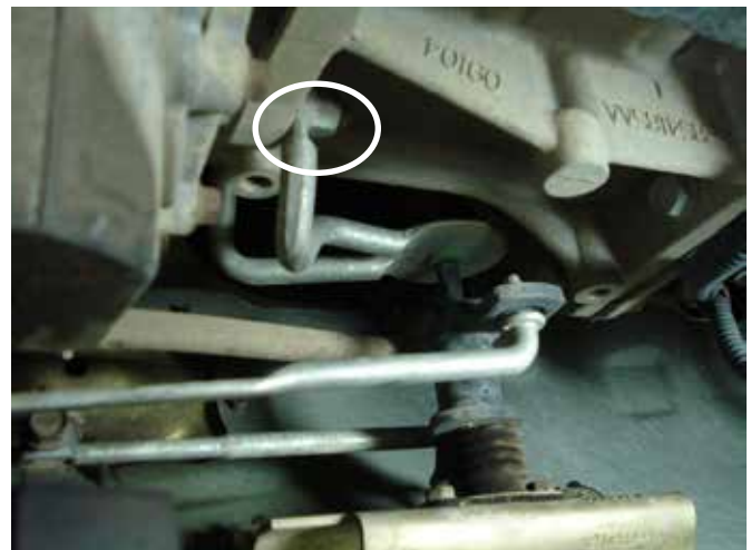
Figure 13A & B

SPECIAL NOTE: The components packaged in this kit have been assembled and machined for specific type of conversions. Modifications to any of the components will void any possible warranty or return privileges. If you do not fully understand modifications or changes that will be required to complete your conversion, we strongly recommend that you contact our sales department for more information. This instruction sheet is only to be used for the assembly of Advance Adapter components. We recommend that a service manual pertaining to your vehicle be obtained for specific torque values, wiring diagrams and other related equipment. These manuals are normally available at automotive dealerships and parts stores.