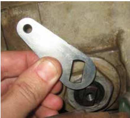
Figure 30: New Transfer Case Shift Lever Orientation