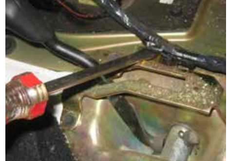
Figure 11: Remove Wire Loom Connector Clip

6. Using a flathead screwdriver, remove the wire loom connector clip from the transfer case shifter bracket. (See Figure 11 )