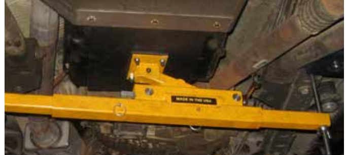
Figure 1: Uni-Raise