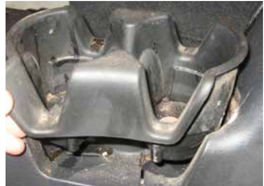
Figure 8: Cup Holder Removal