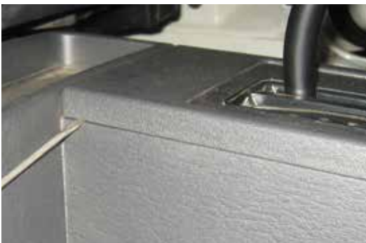
Figure 9: Transmission Shift Indicator