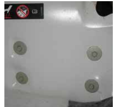
Figure 12: Shifter Pivot Assembly Bolts

9. Using a 10 mm socket, remove the four bolts securing the shifter pivot assembly. (See Figure 12 ) You will have to lift up the carpet to get to these bolts. The bracket will fall when the bolts are removed if it isn't held. Seal the bolt holes with the four supplied black plastic plugs.