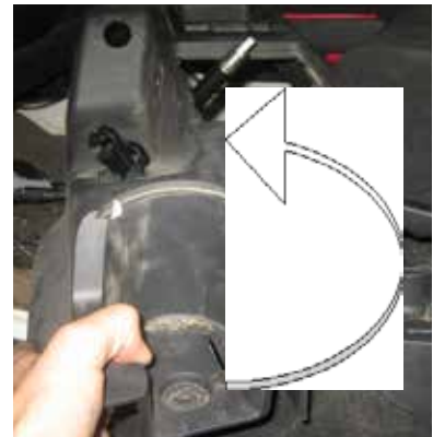
Figure 17: Console Install