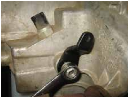
Figure 29: New Transfer Case Shift Lever Orientation