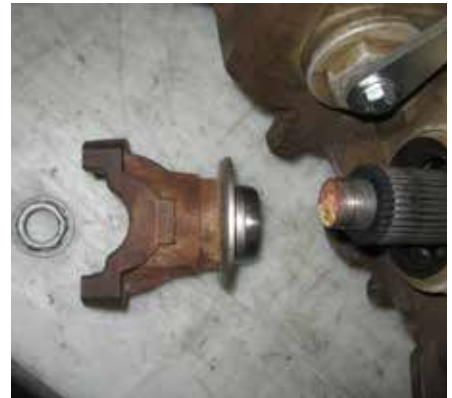
Figure 31: Proper Yoke Installation Order

SPECIAL NOTE: The components packaged in this kit have been assembled and machined for specific type of conversions. Modifications to any of the components will void any possible warranty or return privileges. If you do not fully understand modifications or changes that will be required to complete your conversion, we strongly recommend that you contact our sales department for more information. This instruction sheet is only to be used for the assembly of Advance Adapter components. We recommend that a service manual pertaining to your vehicle be obtained for specific torque values, wiring diagrams and other related equipment. These manuals are normally available at automotive dealerships and parts stores.