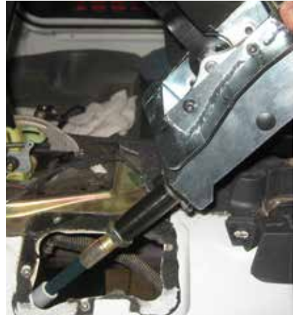
Shifter Box Assembly w/ T-Case Cable