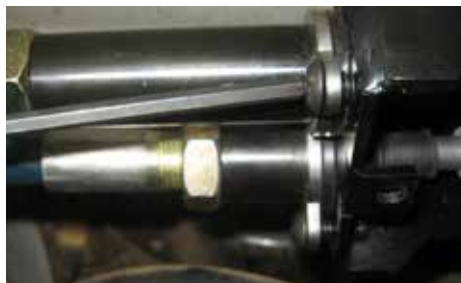
Figure 22: Tighten Retaining Clip

SPECIAL NOTE: The components packaged in this kit have been assembled and machined for specific type of conversions. Modifications to any of the components will void any possible warranty or return privileges. If you do not fully understand modifications or changes that will be required to complete your conversion, we strongly recommend that you contact our sales department for more information. This instruction sheet is only to be used for the assembly of Advance Adapter components. We recommend that a service manual pertaining to your vehicle be obtained for specific torque values, wiring diagrams and other related equipment. These manuals are normally available at automotive dealerships and parts stores.