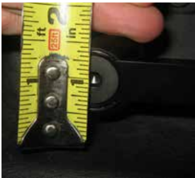
Figure 21: 1" from console