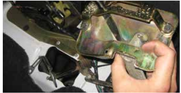
Figure 13: Remove Shifter Linkage