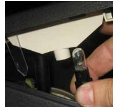
Figure 10: Indicator Light

SPECIAL NOTE: The components packaged in this kit have been assembled and machined for specific type of conversions. Modifications to any of the components will void any possible warranty or return privileges. If you do not fully understand modifications or changes that will be required to complete your conversion, we strongly recommend that you contact our sales department for more information. This instruction sheet is only to be used for the assembly of Advance Adapter components. We recommend that a service manual pertaining to your vehicle be obtained for specific torque values, wiring diagrams and other related equipment. These manuals are normally available at automotive dealerships and parts stores.