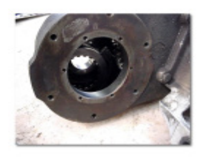
end play. The pocket bearing should be