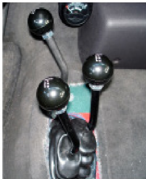
ABOVE: THE STANDARD ATLAS SHIFTERS MOUNTED BEHIND THE PLANETARY CABLE SHIFTER IN A DODGE 2500.

SPECIAL NOTE: The components packaged in this kit have been assembled and machined for specific type of conversions. Modifications to any of the components will void any possible warranty or return privileges. If you do not fully understand modifications or changes that will be required to complete your conversion, we strongly recommend that you contact our sales department for more information. This instruction sheet is only to be used for the assembly of Advance Adapter components. We recommend that a service manual pertaining to your vehicle be obtained for specific torque values, wiring diagrams and other related equipment. These manuals are normally available at automotive dealerships and parts stores.