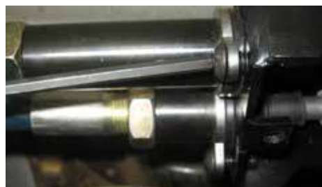
Figure 22: Tighten Retaining Clip

SPECIAL NOTE: The components packaged in this kit have been assembled and machined for specific type of conversions. Modifications to any of the components will void any possible warranty or return privileges. If you do not fully understand modifications or changes that will be required to complete your conversion, we strongly recommend that you contact our sales department for more information. This instruction sheet is only to be used for the assembly of Advance Adapter components. We recommend that a service manual pertaining to your vehicle be obtained for specific torque values, wiring diagrams and other related equipment. These manuals are normally available at automotive dealerships and parts stores.