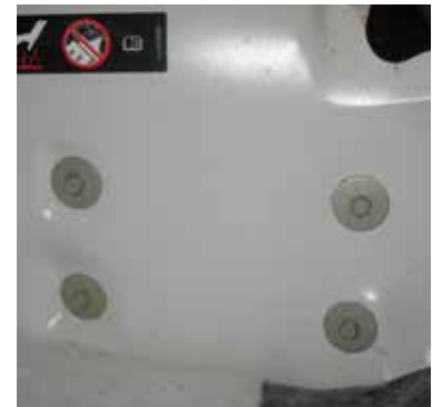
Figure 12: Shifter Pivot Assembly Bolts