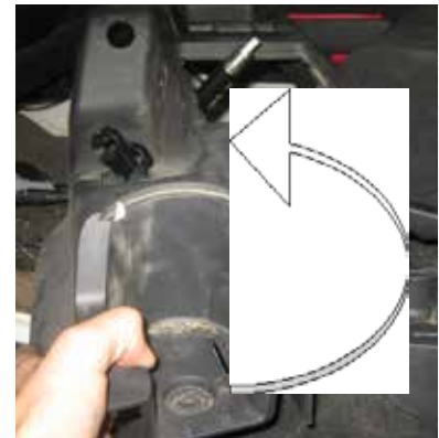
Figure 17: Console Install