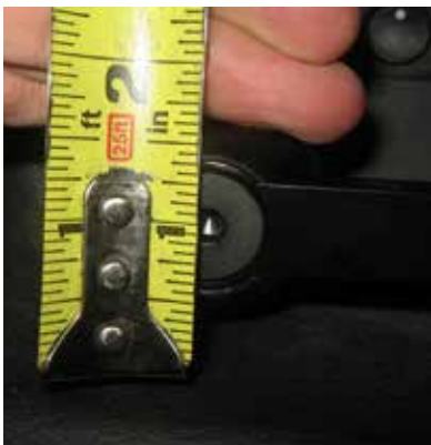
Figure 21: 1" from console