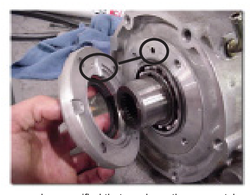
Once you have verified that you have the same style input gear, install the gear into the planetary, install the

snap ring. Re-install the planetary assembly into the case and secure the input to the bearing with the front snap ring. Note: The only part you should have left out of the case is the old input gear. During reassembly, make sure the oil return hole matches the front retainer hole.