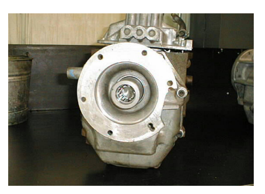
Transmission ready to fit transfer case.