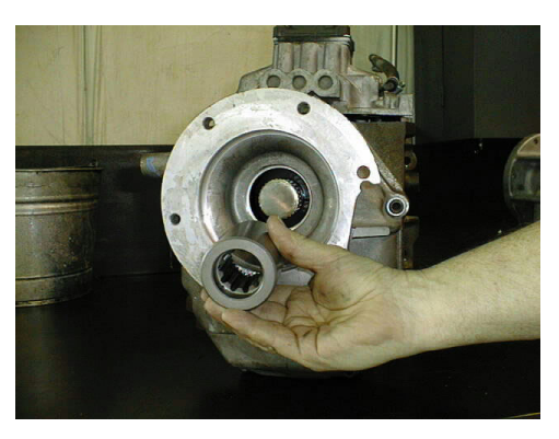
New coupler for 31 spline.