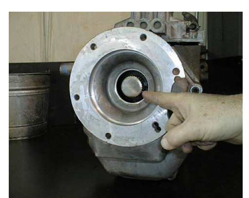
Output shaft shortened - 31 tooth.