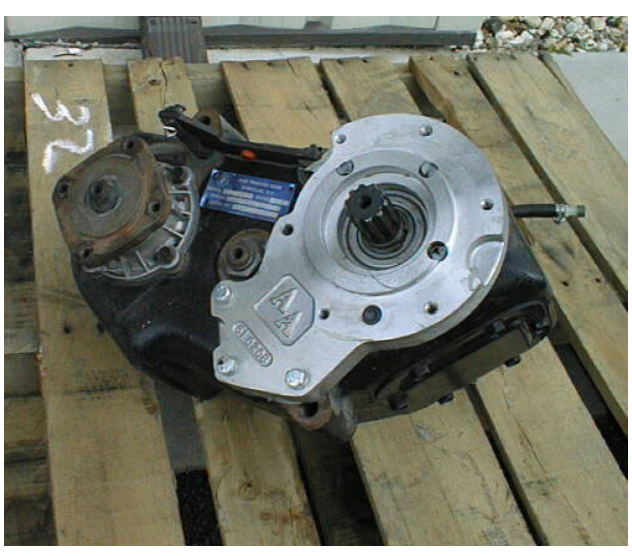
Side view of the transfer case and adapter.