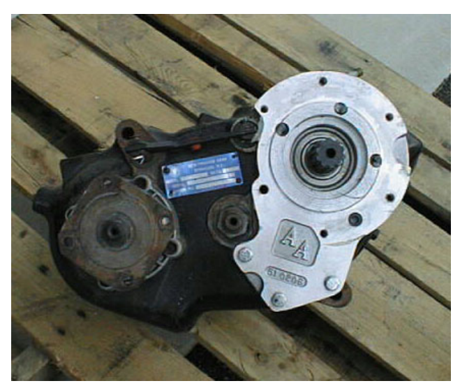
NP 205 transfer case with adapter in position.

P.O. Box 247, 4320 Aerotech Center Way Paso Robles, CA 93447 Telephone: (800) 350-2223 Fax: (805) 238-4201 PAGE 4 OF 4 Page Rev. Date: 02-05-18 P/N: 50-0218