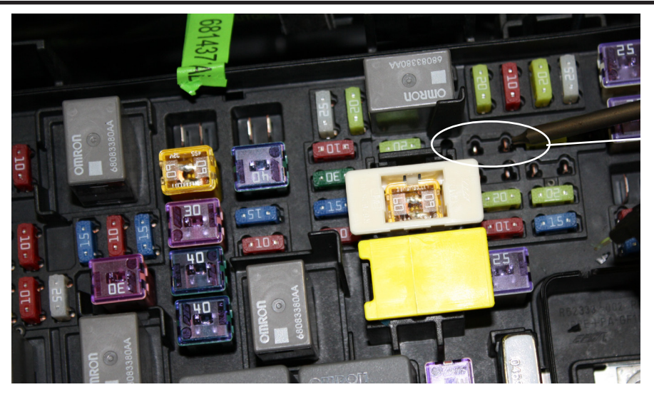
2012 -18 Jeep JK's use power from fuse slot M9.

Plug the 3 wire Delphi plug into the power supply you ran earlier. Note the purple wire will not be used.