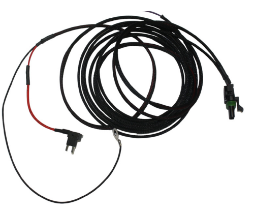
ATR 2-leg micro fuse; main fuse at specified circuit rating up to 30A max. Additional circuit up to 10A max.

Jeep JK: The Fuse attaches in the fuse box in the empty fuse slot labeled M14 - TTOW BUX on Jeeps up to 2011 and on 2012-18 JK's use slot M9. Refer to the under side of the fuse box lid for the proper location. (see photo's on page 3 and 4)