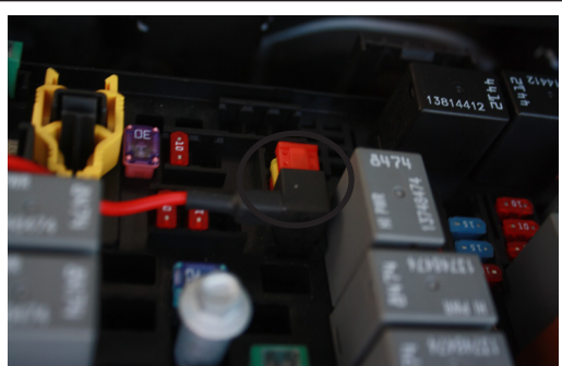
Figure 3: JL Power Connection

A notch will need to be cut into the fuse box for the wire to run out, which can also be seen in Figure 3 . The ground can be run along the side of the fuse block to the ground terminal on the passenger fender next to the fuse box.