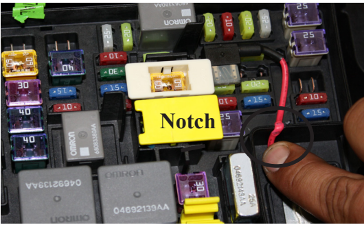
Figure 3: JK Power Connection