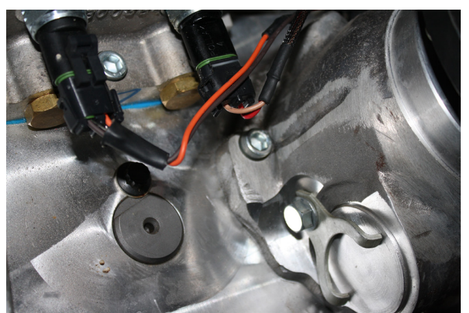
4WD AND LOW RANGE SWITCHES PROPERLY PLUGGED IN ATLAS