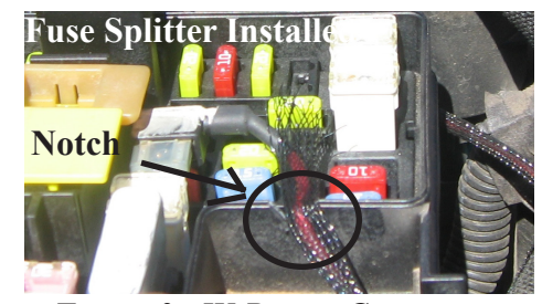
Figure 3: JK Power Connection