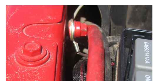
Figure 4: JK Ground Terminal

The components packaged in this kit have been assembled and machined for specific type of conversions. Modifications to any of the SPECIAL NOTE: components will void any possible warranty or return privileges. If you do not fully understand modifications or changes that will be required to complete your conversion, we strongly recommend that you contact our sales department for more information. This instruction sheet is only to be used for the assembly of Advance Adapter components. We recommend that a service manual pertaining to your vehicle be obtained for specific torque values, wiring diagrams and other related equipment. These manuals are normally available at automotive dealerships and parts stores.