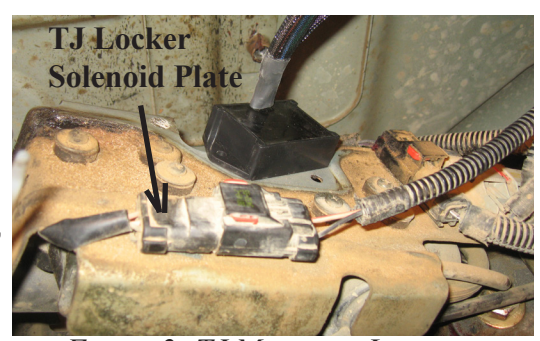
Figure 2: TJ Mounting Location